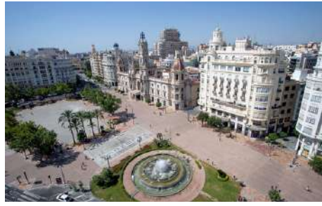
Valencia City Center