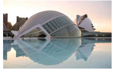
City of Arts and Sciences