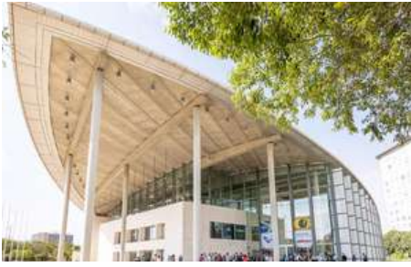
Palacio de Congresos de Valencia